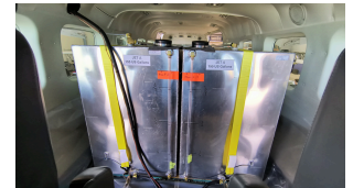
Reinstalling the ferry tanks in MAF Caravan (extra fuel tanks)