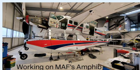
Working on MAF's Amphib