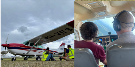
Briefing our flights in the fields where we parked + tented