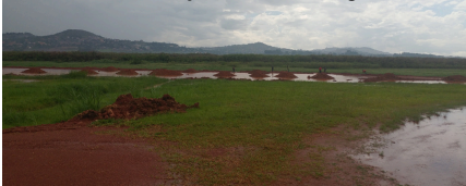
400+ truckloads of murram being poured on the runway when I was in Uganda

The need for a floatplane was a common conversation - I never thought 5 years later I would be in the Netherlands working on the floatplane bound for Uganda! It's been a huge project getting this aircraft which has taken much work from many people across the globe - exciting to see how this tool will be used to better help + connect people living on the many islands of Lake Victoria and maybe I will have the chance to fly it one day! 😊