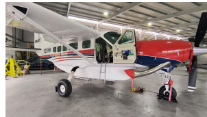
Working on new MAF Caravan going to PNG

Working with 2 previous MAF engineers, we've all lived in Uganda! Hangar One is becoming quite the surprising MAF hub! 😊