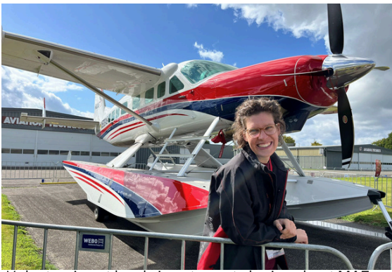
Volunteering at local airport event sharing about MAF

It's been exciting how my part time job at Hangar One has been connecting with MAF. Although it's a busy balance working at a commercial shop alongside all my MAF preparations, working here is definitely one of my biggest highlights since moving to NL. It's fun working with a team of 20 engineers & I'm enjoying learning new things from everyone. Interesting working with a large team in a busy & demanding commercial environment – I'm always surprised each week with what new projects I find myself doing & the cool conversations God opens up 😊