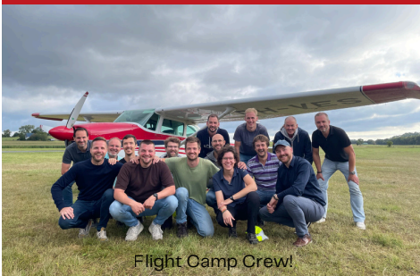
Flight Camp Crew!